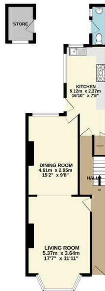
GROUND FLOOR 57.0 sq.m. (613 sq.ft.) approx.