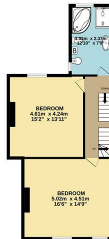
1ST FLOOR 58.0 sq.m. (624 sq.ft.) approx.