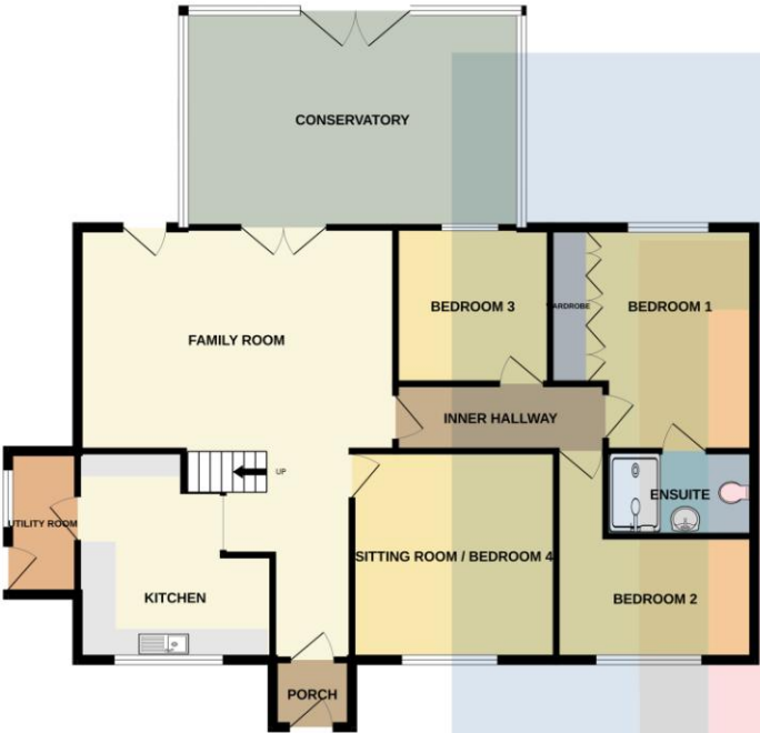
GROUND FLOOR 1293 sq.ft. (120.1 sq.m.) approx.