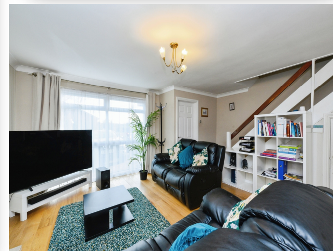
The Springs, Broxbourne EN10 6EW