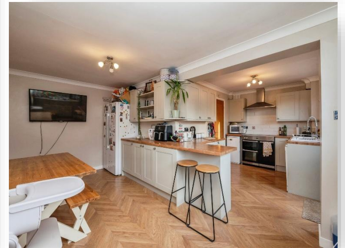
The Corner House, Holgate Road, North Walsham NR28 9LP