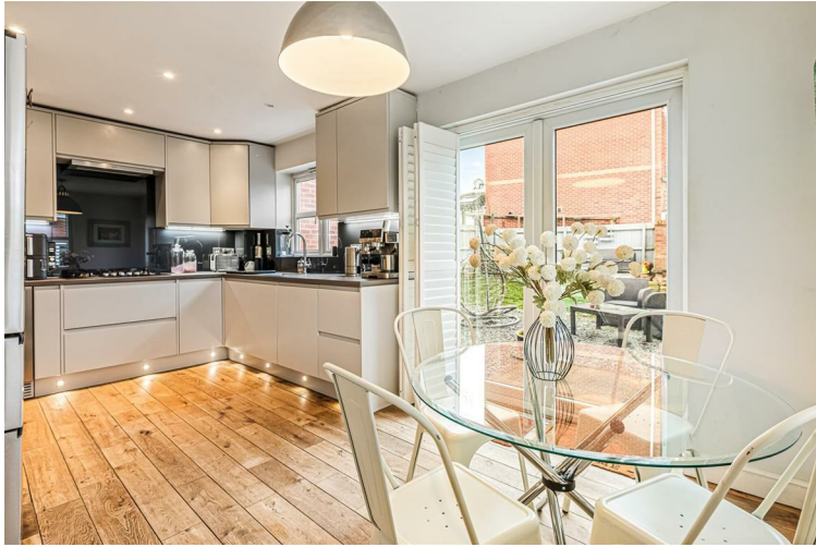
DINING KITCHEN 16'6" x 9'4" (5.03 x 2.87)

Fitted units with worktops and splashbacks, undermount sink, four ring gas hob with extractor, integrated microwave, oven and dishwasher, space for fridge freezer, plinth lighting, radiator, solid wood flooring, double glazed window to side and front aspect, pair of double glazed doors to side aspect with bi-fold shutters, leading out into the garden