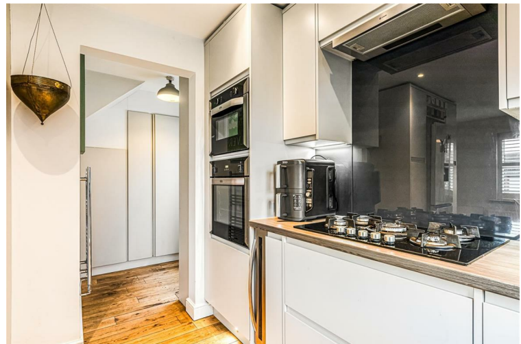
UTILITY ROOM 5'6" x 4'9" (1.70 x 1.45)

Built in cupboard's, heated towel rail, solid wood flooring, door to side aspect.