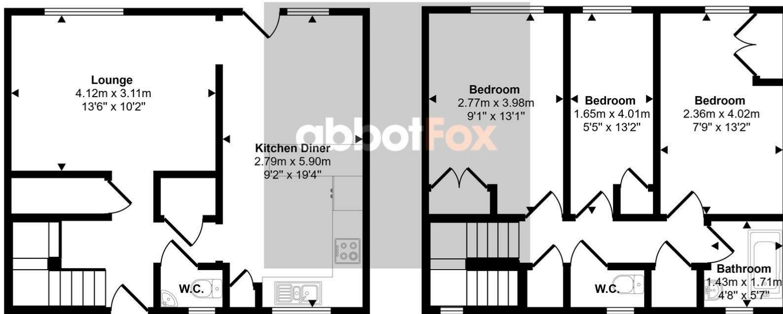
Ground Floor Approx 42 sq m / 447 sq ft

Approx Gross Internal Area 83 sq m / 897 sq ft