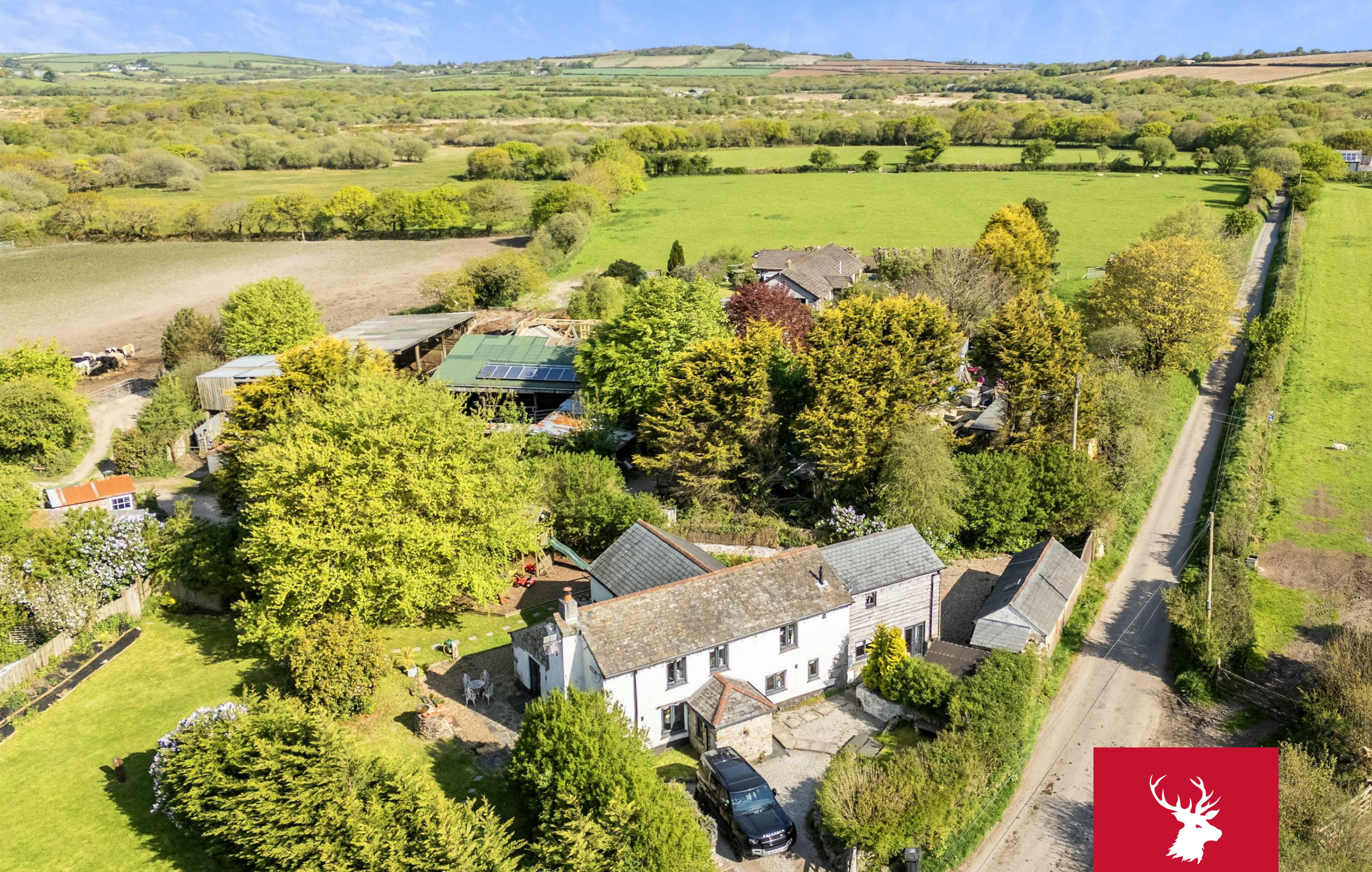
Beech Tree Cottage