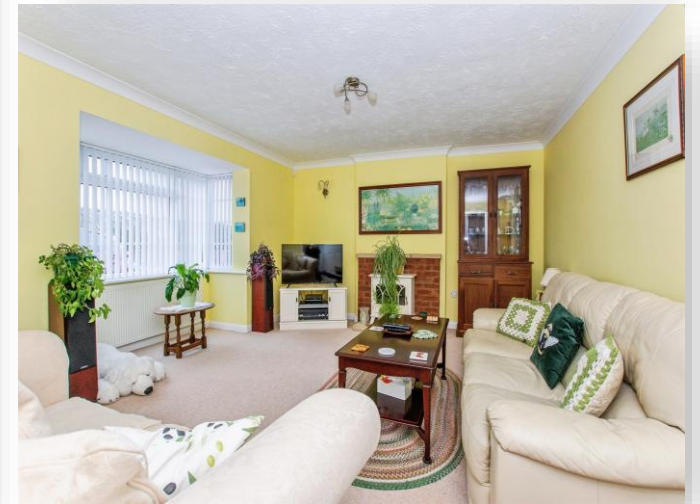
Fridaybridge Road, Elm WISBECH PE14 0AT