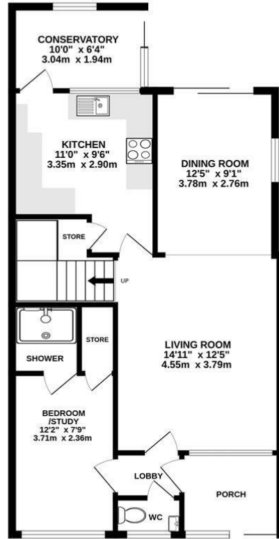
GROUND FLOOR 736 sq.ft. (68.4 sq.m.) approx.