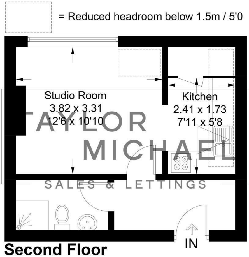
Illustration for identification purposes only, measurements are approximate, not to scale. Imageplansurveys @ 2026