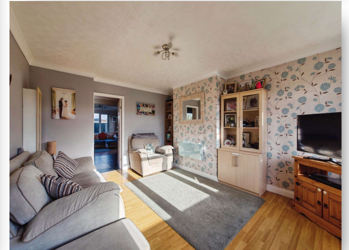
St. Michaels Close, Billingham Lincoln LN4 4EZ