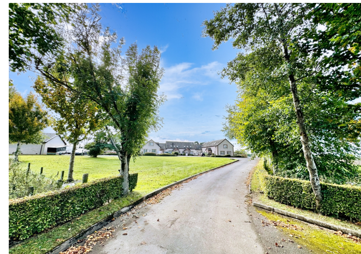
Selvieland Farm Cottages Houston Road, Houston