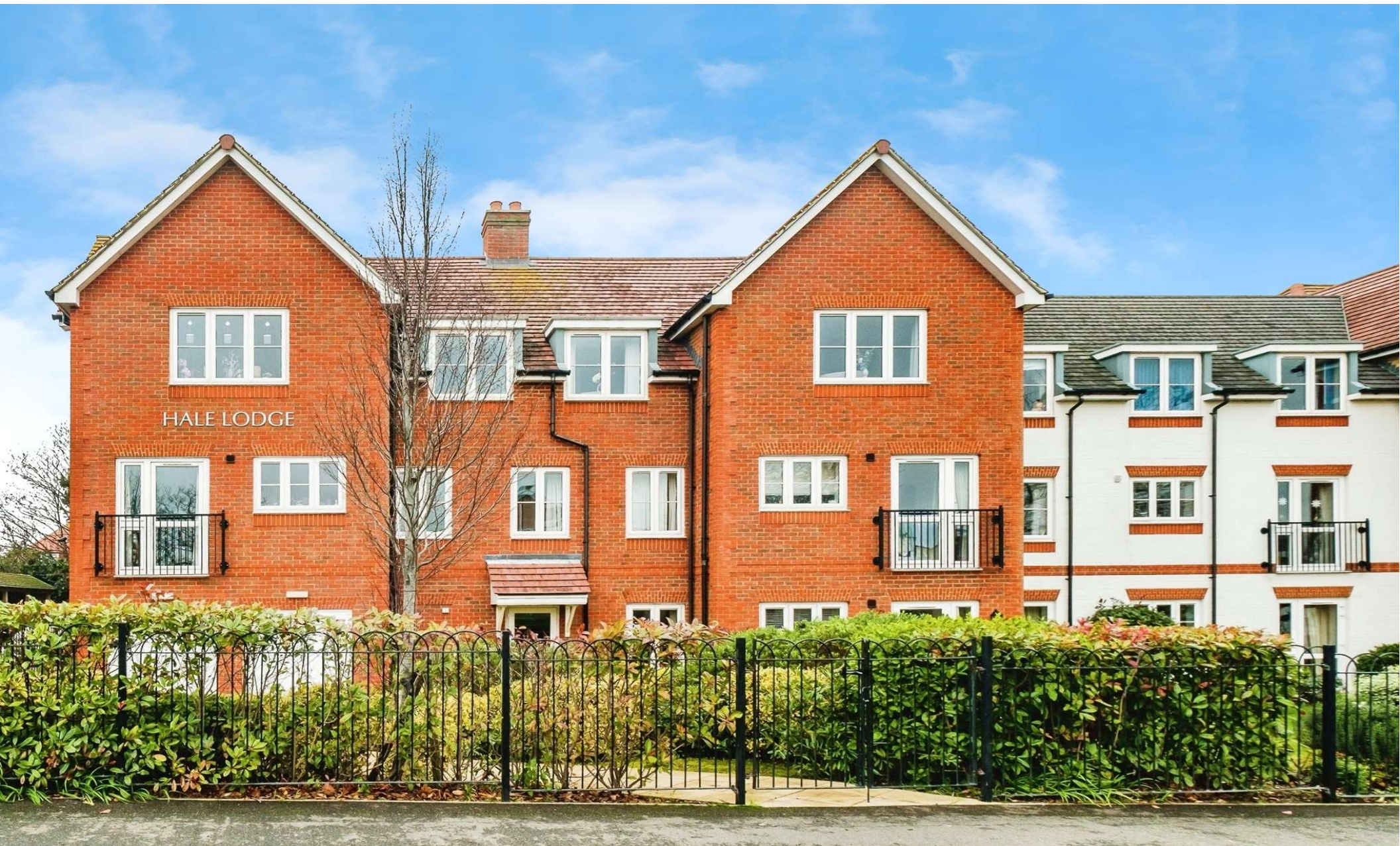
Hale Lodge Fitzalan Road, LITTLEHAMPTON BN17 5ET