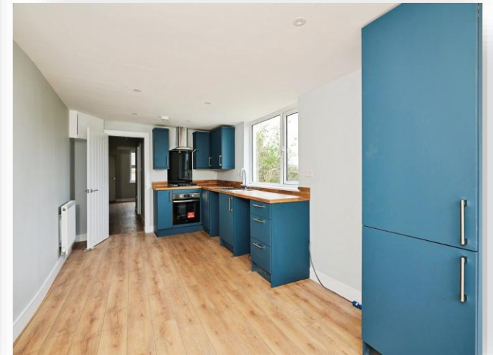
Cross Street, Farcet Peterborough PE7 3DD