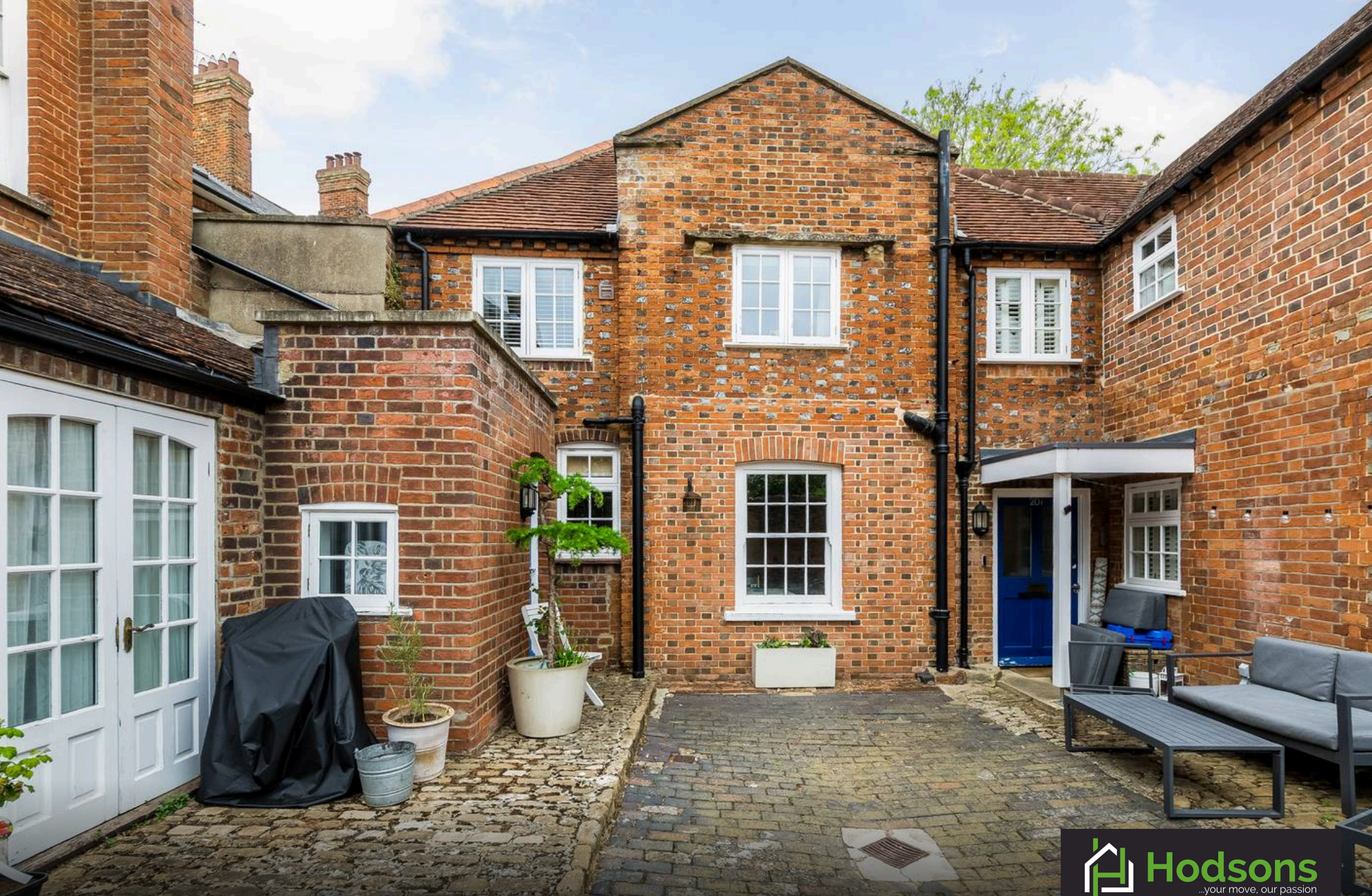
Mews Cottage, 20E Twickenham House, Abingdon OX14 5EA