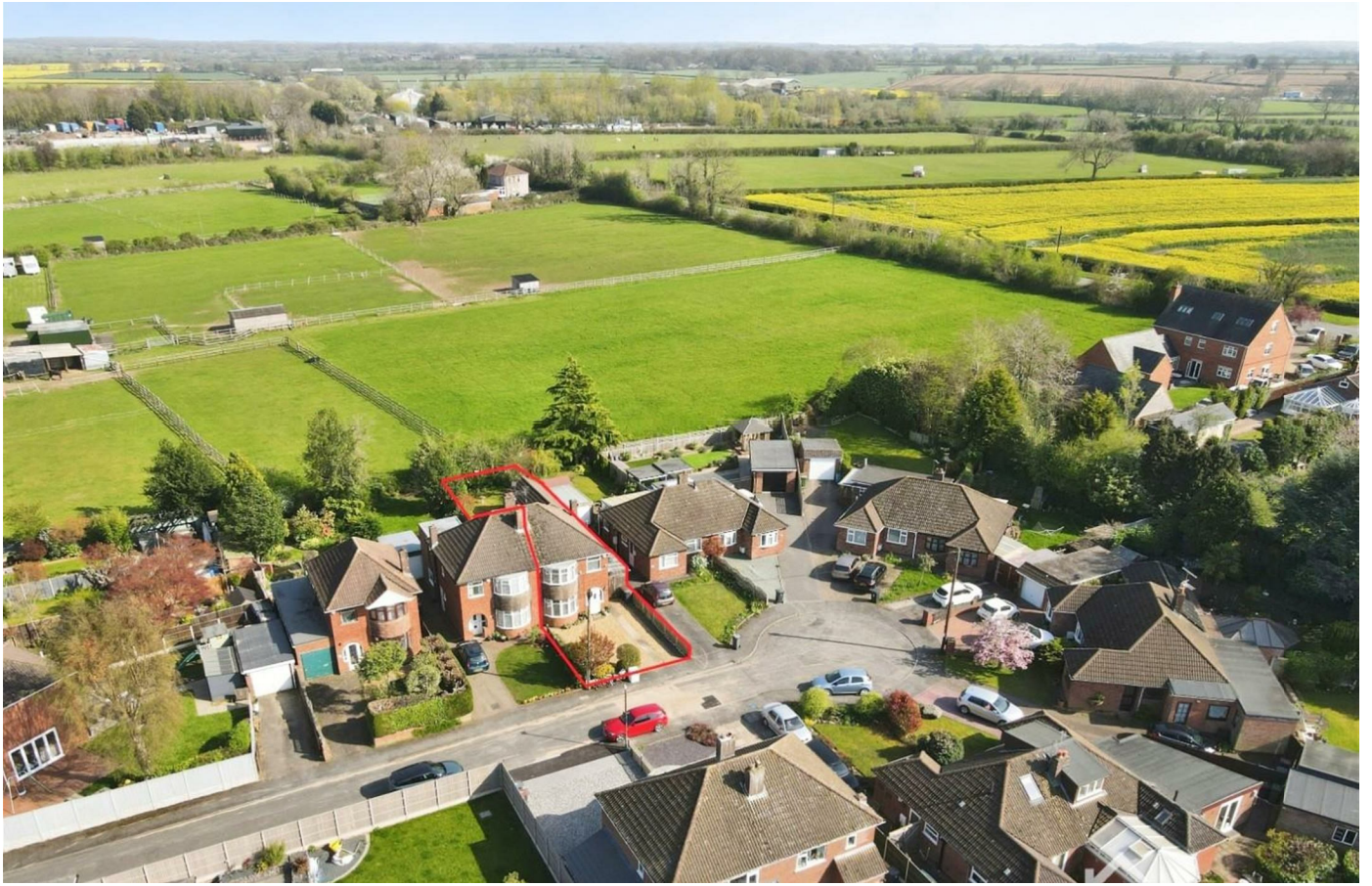
Morland Close, Bulkington, Bedworth