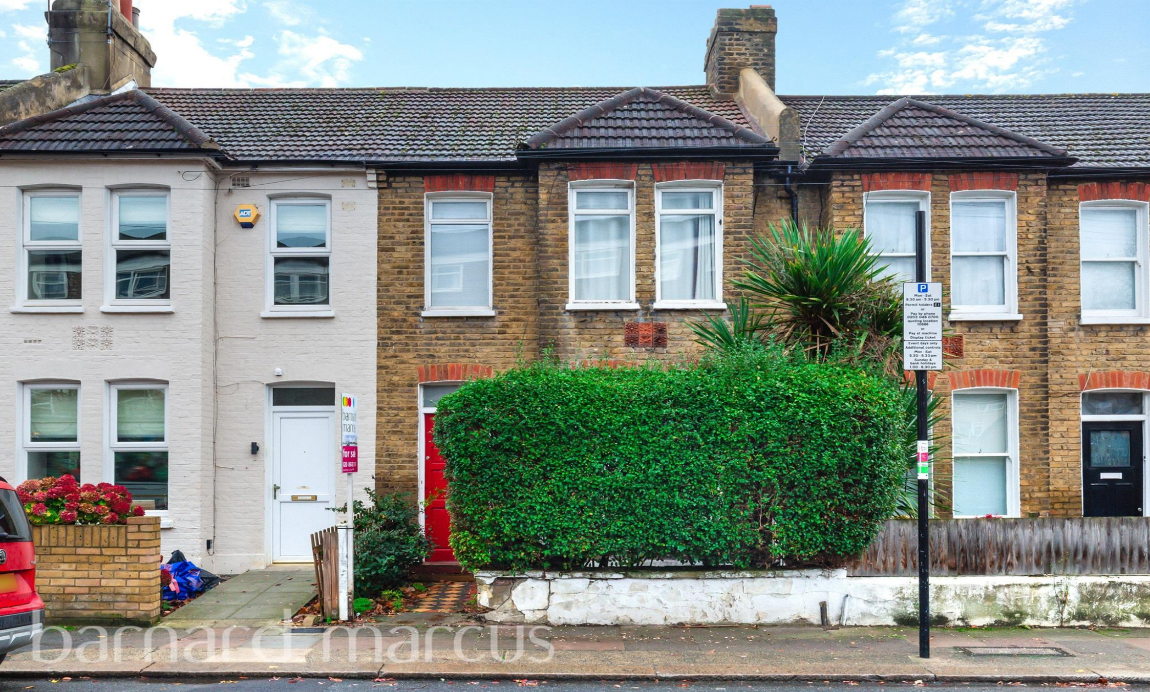
Smallwood Road, London SW17 0TU