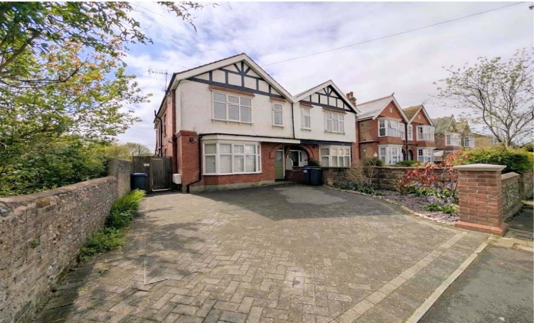
First Floor Flat St. Michaels Road,Worthing BN11 4RY