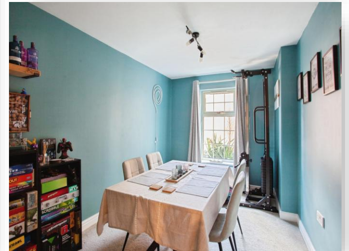
Challiner Mews, Catcliffe Rotherham S60 5UW