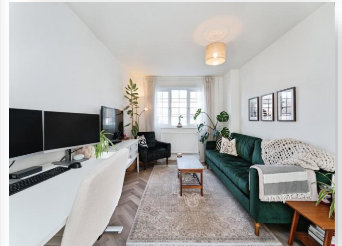
Kingfisher Close, March PE15 9HS