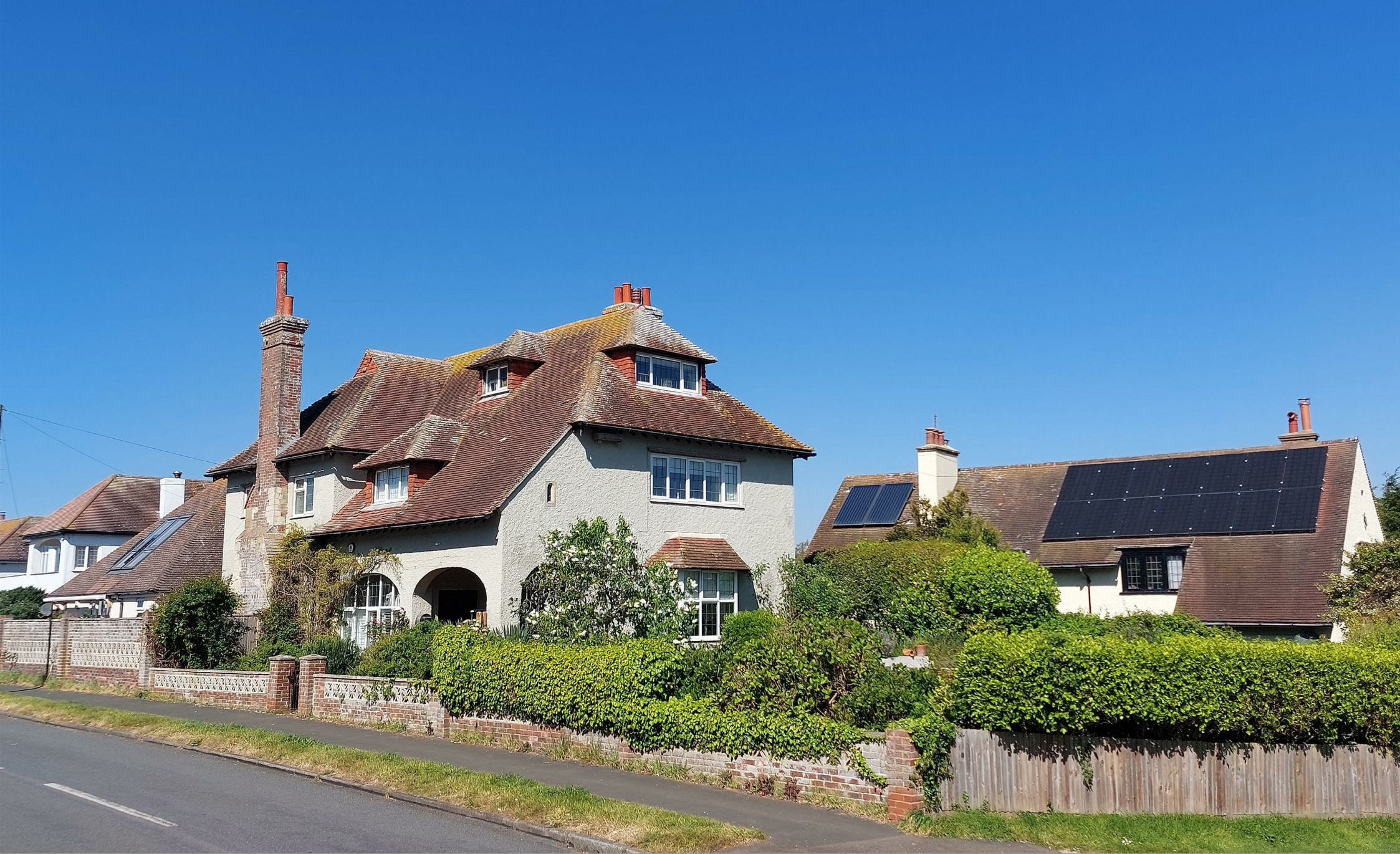
The Trees, 29 Corsica Road, Seaford, BN25 1BD