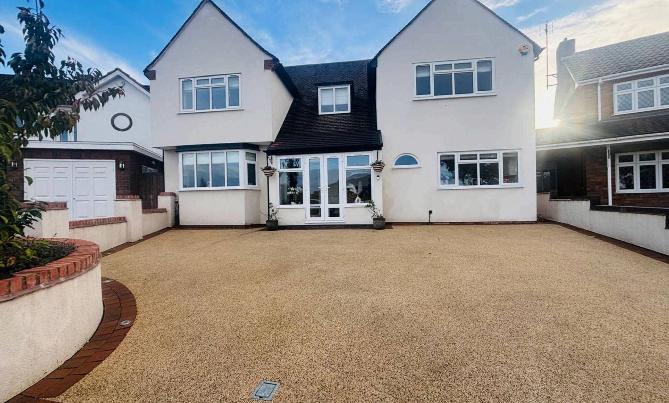
Inglewood Grove, Sutton Coldfield - B74 3LN £850,000