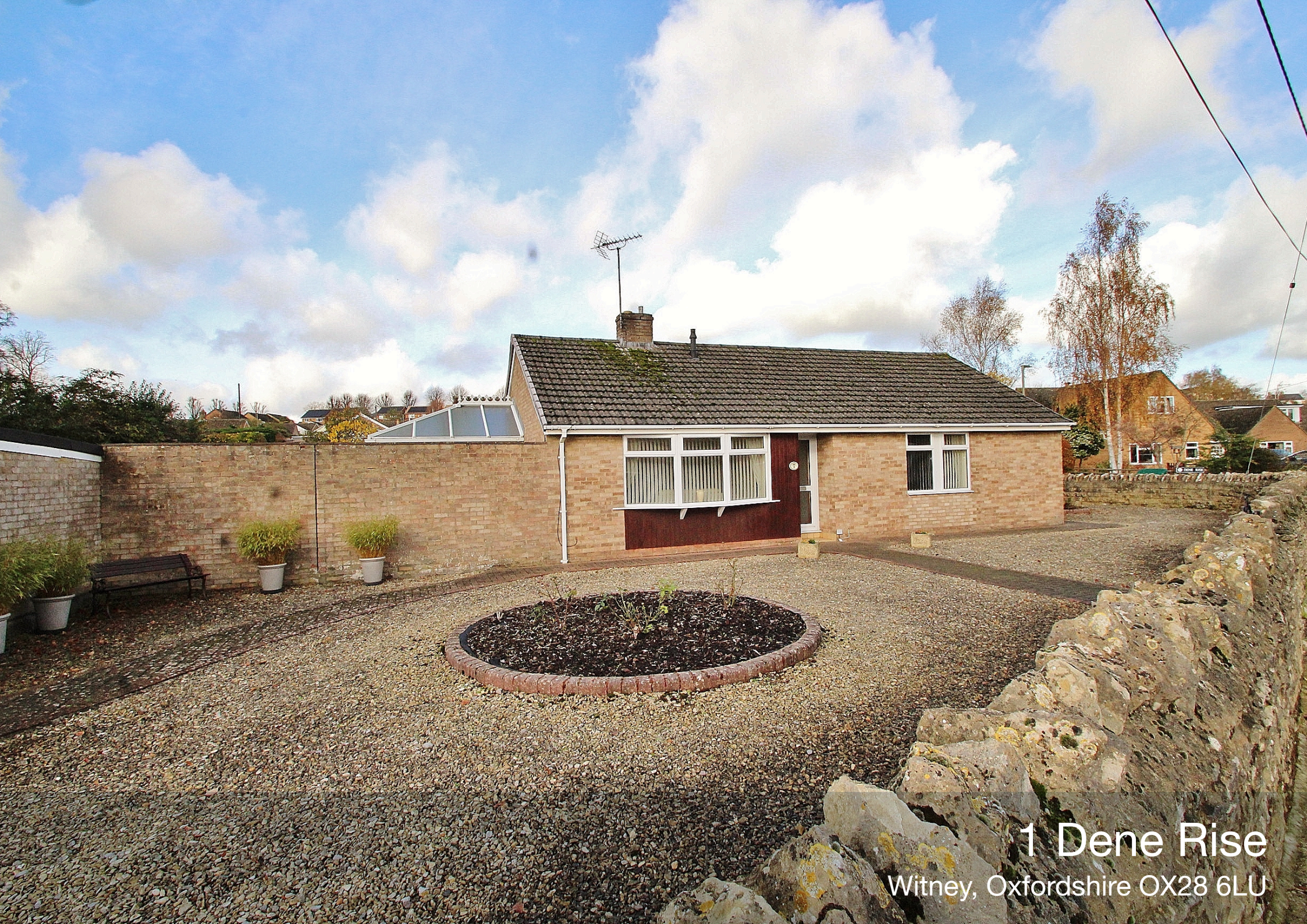
1 Dene Rise Witney, Oxfordshire OX28 6LU