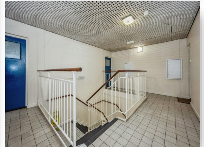
Philip Larkin House, The Avenue, Bedford, MK40 1EF