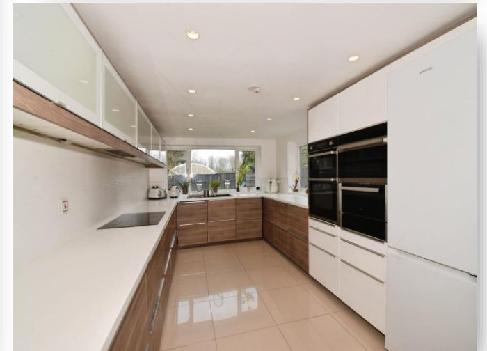
The Oval, Oadby Leicester LE2 5JB