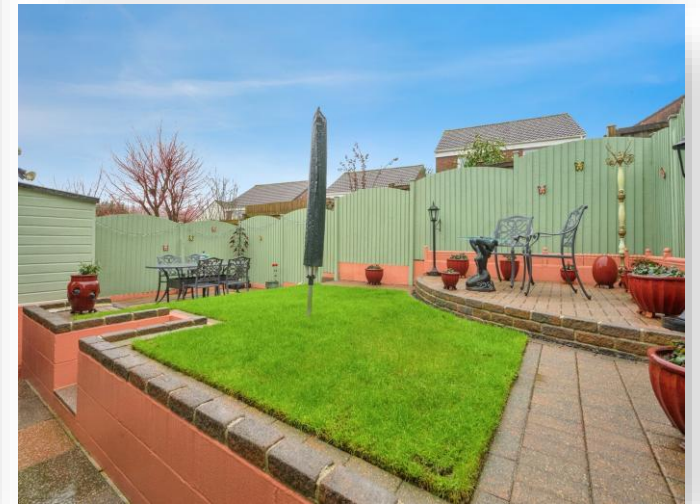
Aycliffe Gardens, Plymouth PL7 1YN