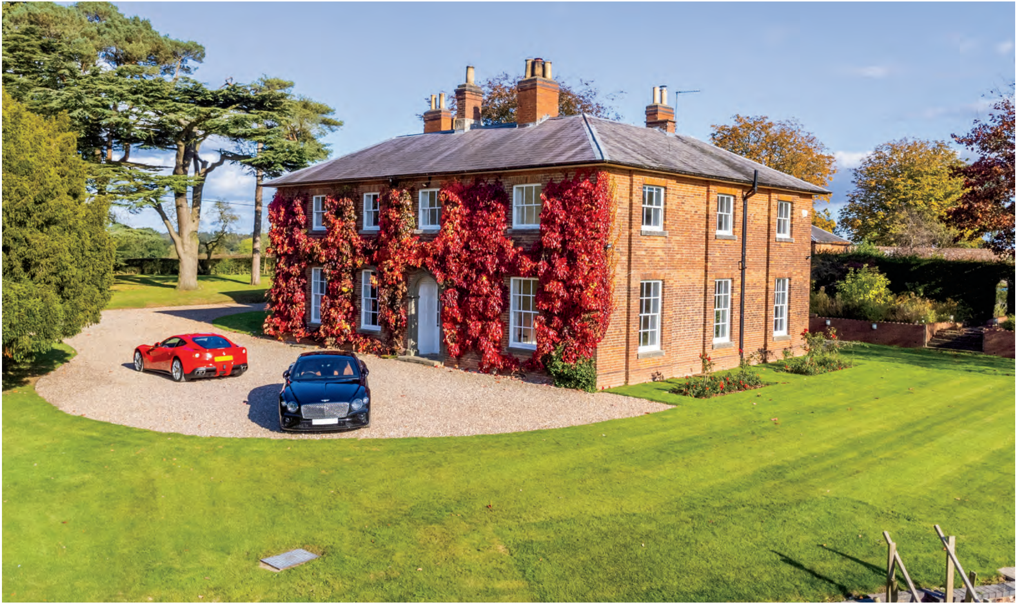
Longford Grange Longford | Ashbourne | Derbyshire | DE6 3AH