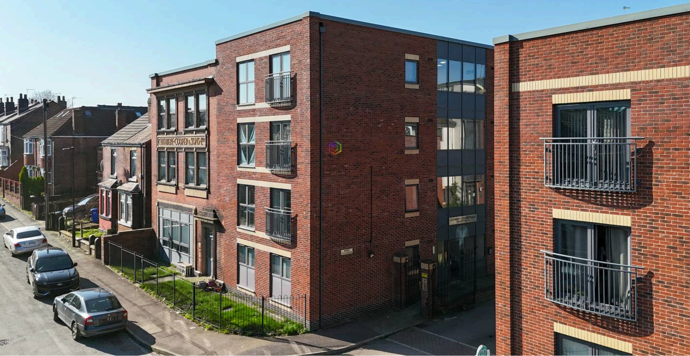
4 Cuthbert Cooper Place, Sheffield £90,000