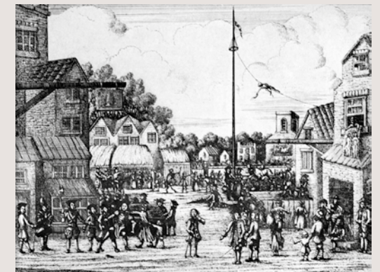
THE MAY FAIR