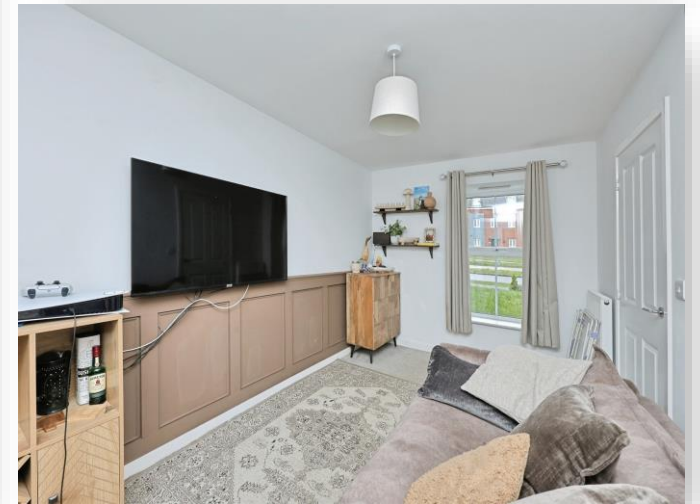
Fairway, Costessey, Norwich, NR8 5HE