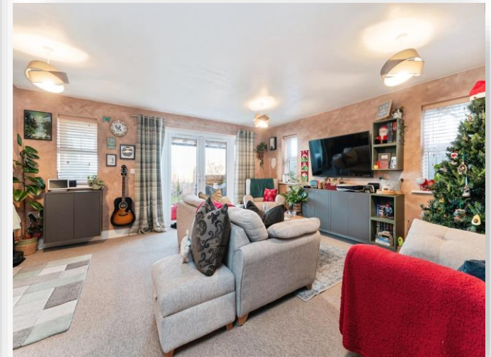
Oilmills Road, Ramsey Huntingdon PE26 2UA