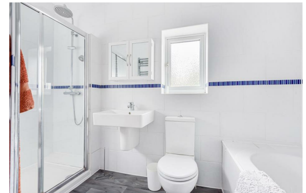
Lavender Cottage | £715,000 Common Hill Road, Braishfield, Hampshire, SO51 0QF