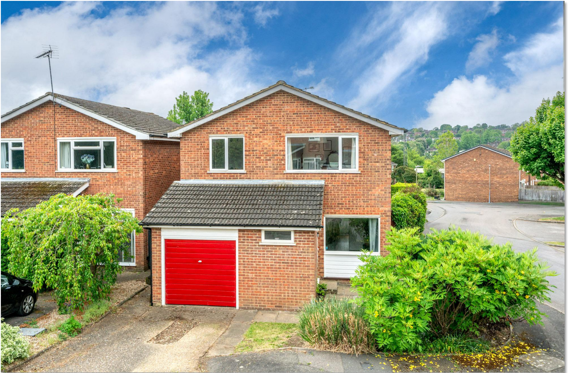
Chiltern Park Avenue, Berkhamsted HP4 1EU