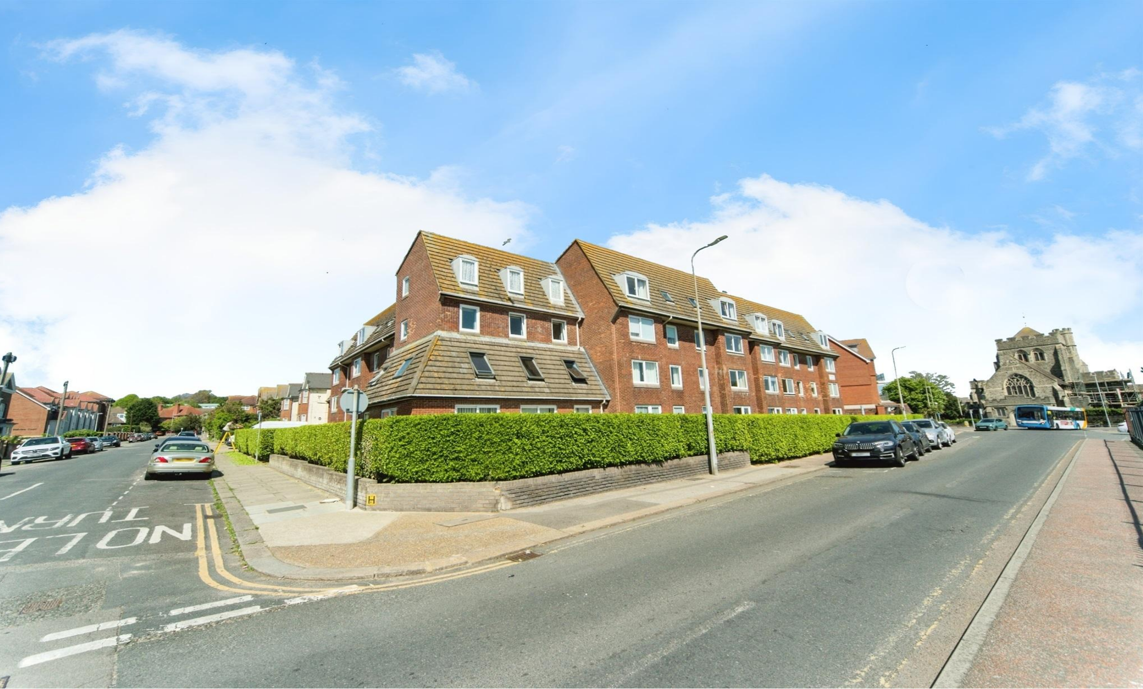
Homehill House - Cranfield Road, Bexhill-On-Sea TN40 1PZ