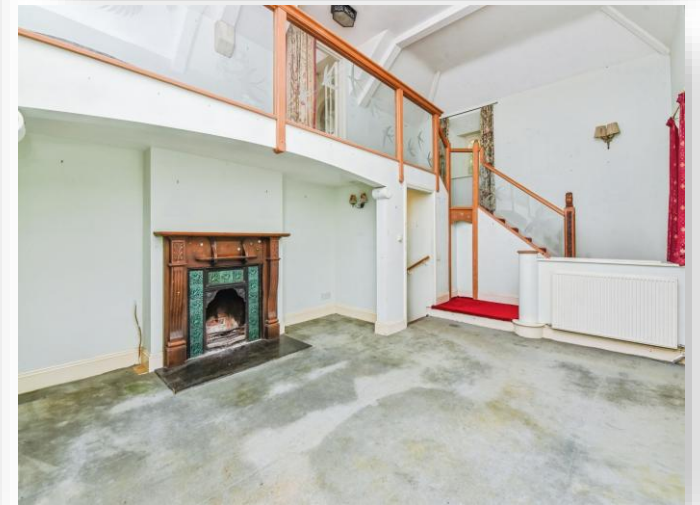
Bird Shadows Mells Lane, Chantry Frome BA11 3LN