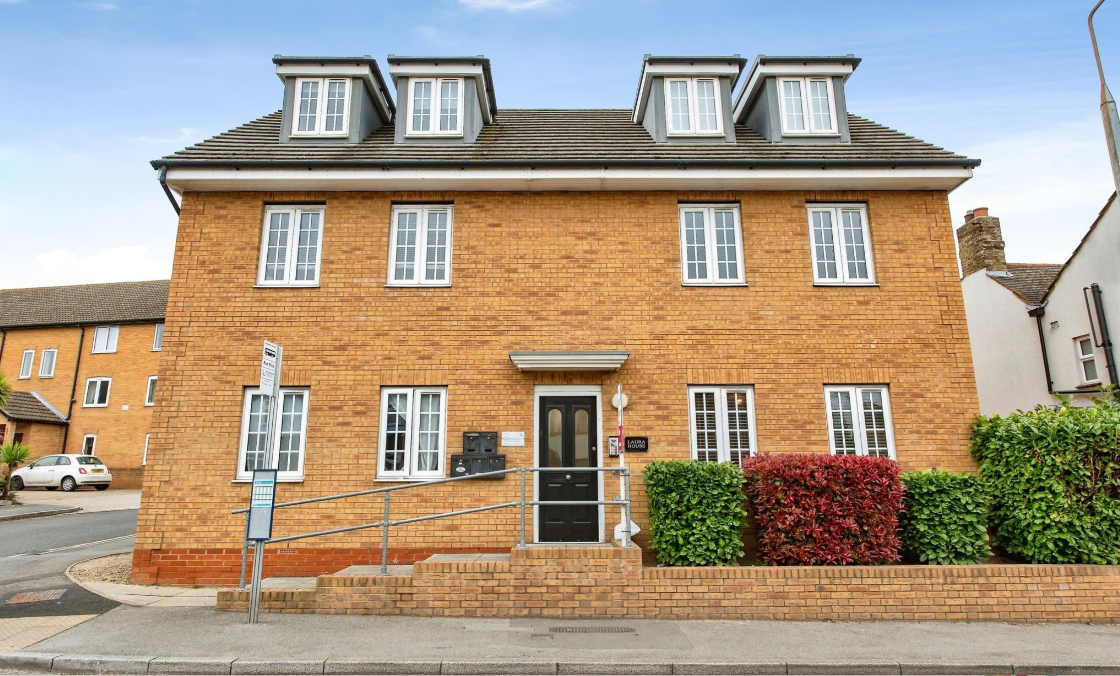
Laura House, High Street, Aveley, South Ockendon RM15 4BP