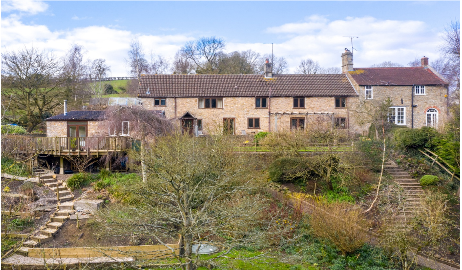
Shortwood Farm House, Batcombe