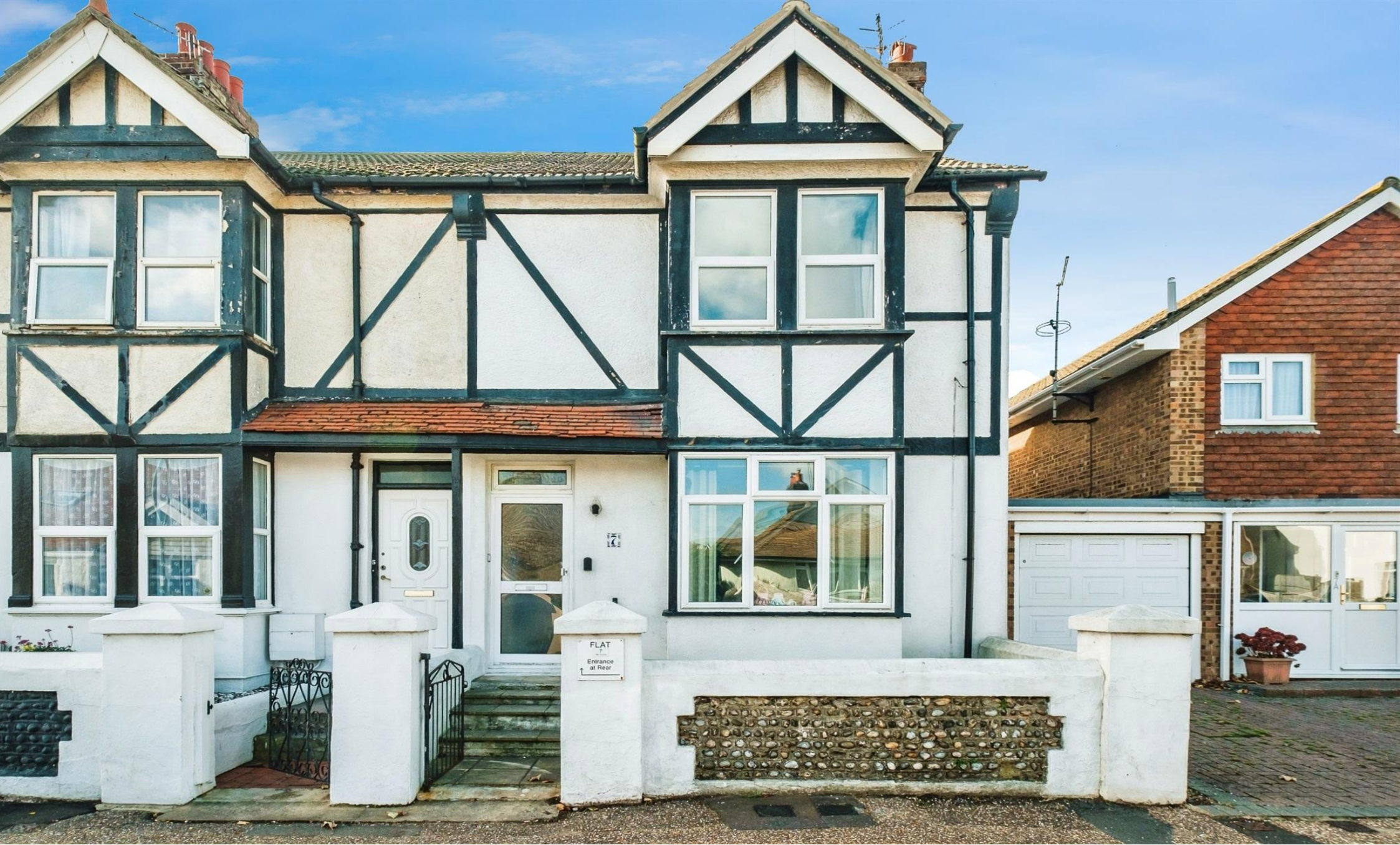
First Floor Flat Chester Avenue, Lancing BN15 8PU