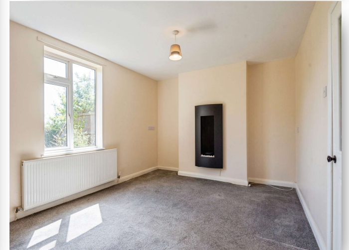
North Beck Cottages North Beck, Scredington NG34 0AD