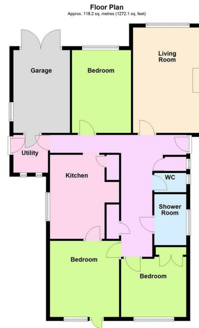
Total area: approx. 118.2 sq. metres (1272.1 sq. feet)