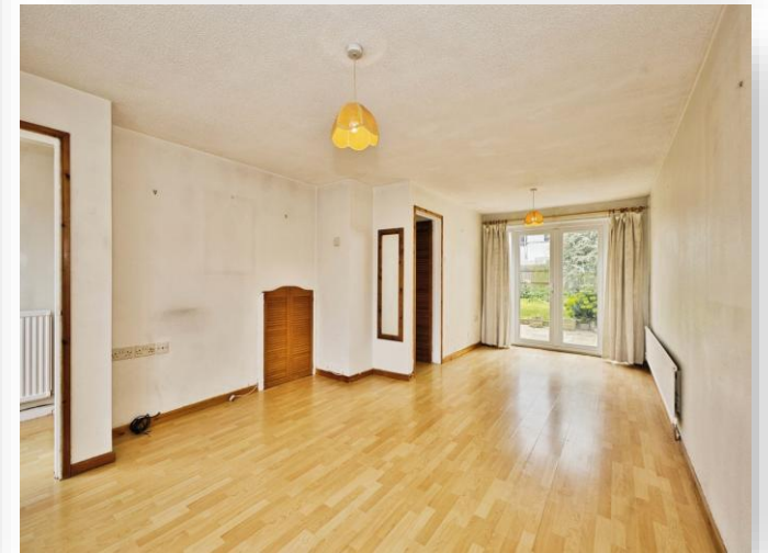
Marwin Close, Martock, TA12 6HJ