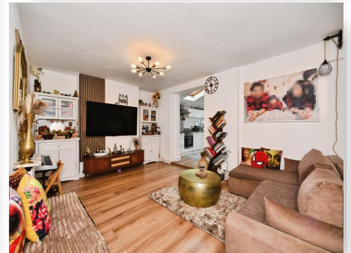
5a Franklin Road, Brighton BN2 3AD