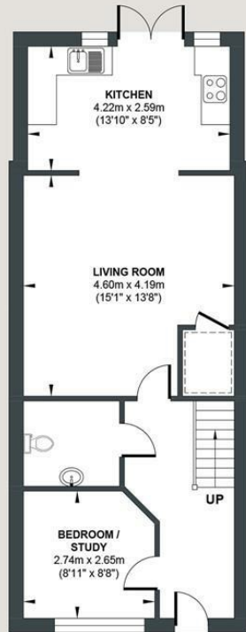
GROUND FLOOR Approximate Floor Area 559.29 sq ft (51.96 sq m)

Approx. Gross Internal Floor Area = 133.18 sq m / 1433.53 sq ft Illustration for identification purposes only, measurements are approximate, not to scale.