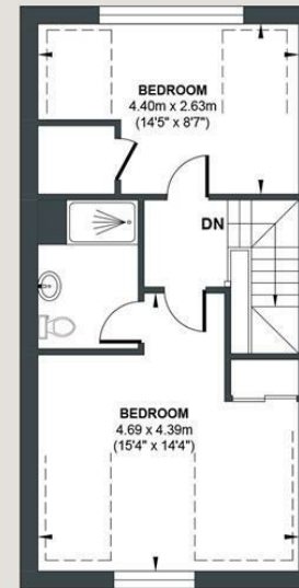
SECOND FLOOR Approximate Floor Area 437.12 sq ft (40.61 sq m)