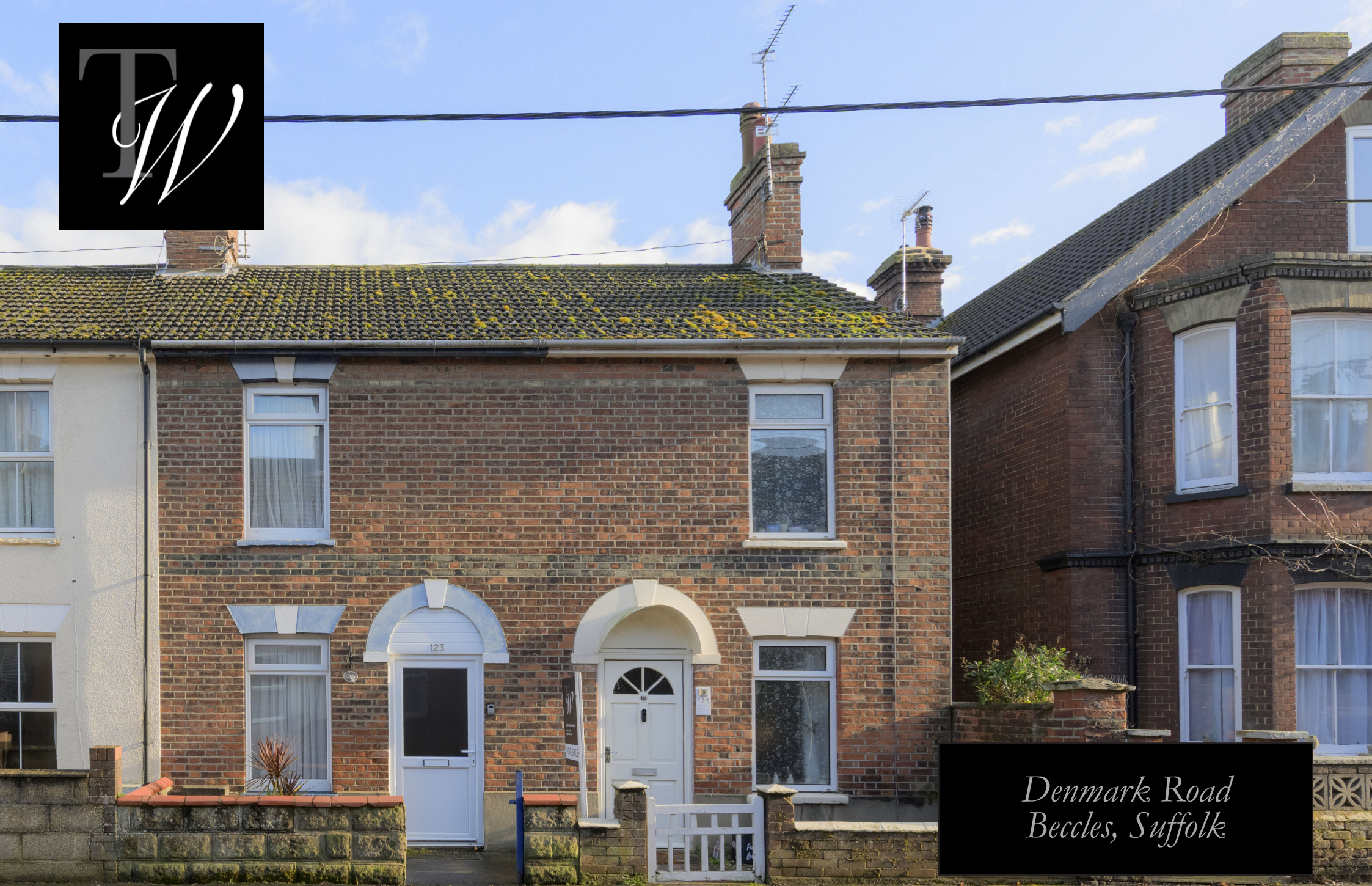
Denmark Road Beccles, Suffolk