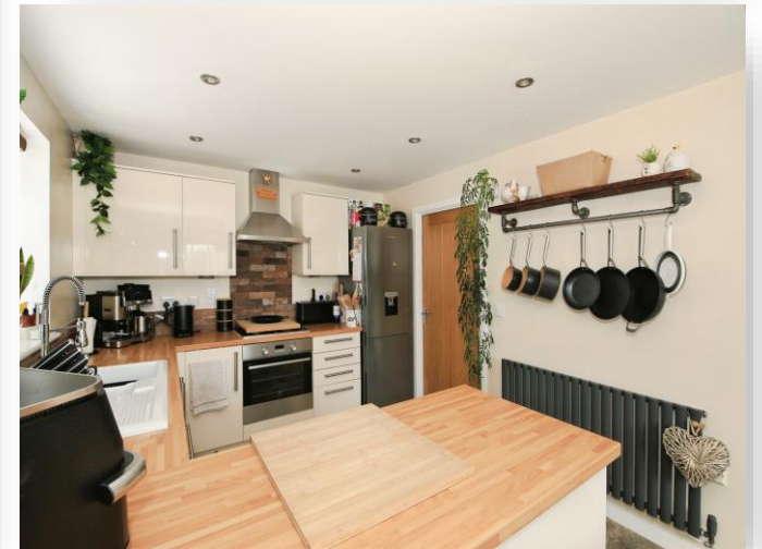
Linus Grove, Peterborough PE2 8FX