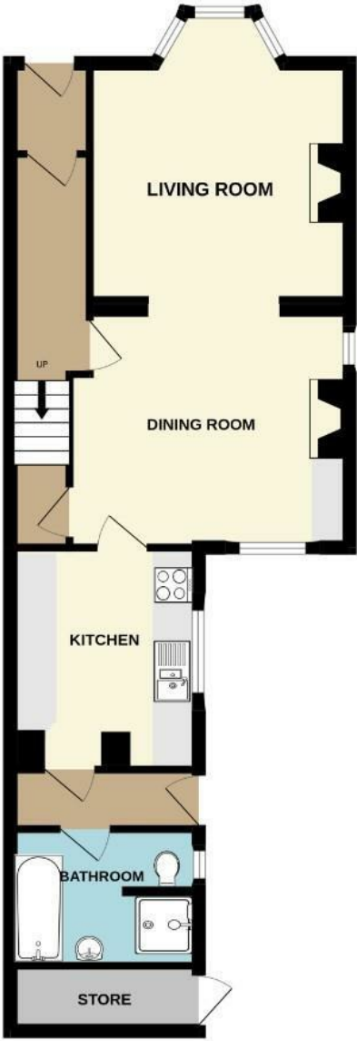
Ground Floor 59.4 sq.m. (639 sq.ft.) approx.