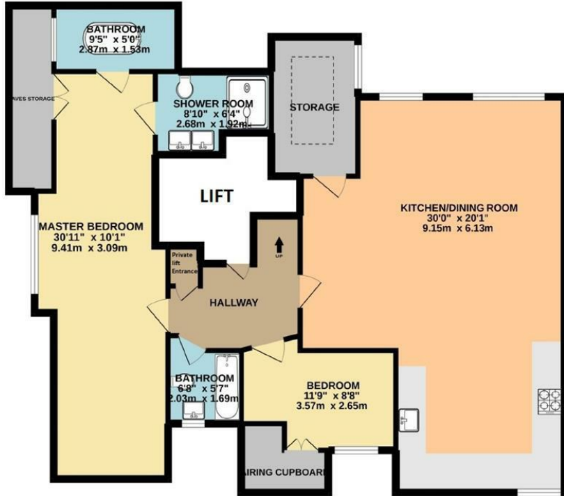
2ND FLOOR 1204 sq.ft. (111.9 sq.m.) approx.