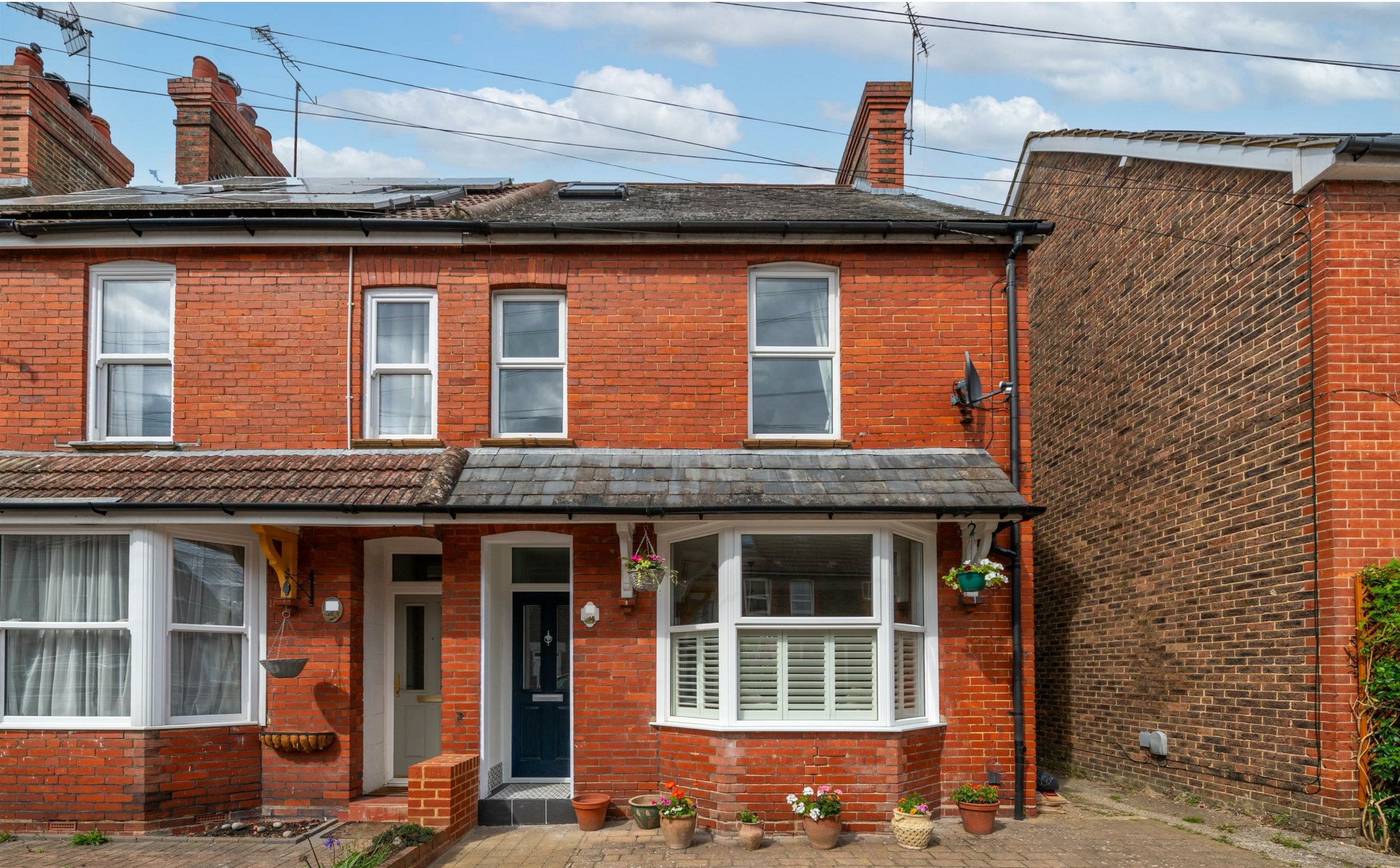
28 Swindon Road, Horsham, West Sussex, RH12 2HD