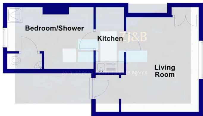
Small Flat , 41 St Johns Hill, Shrewsbury