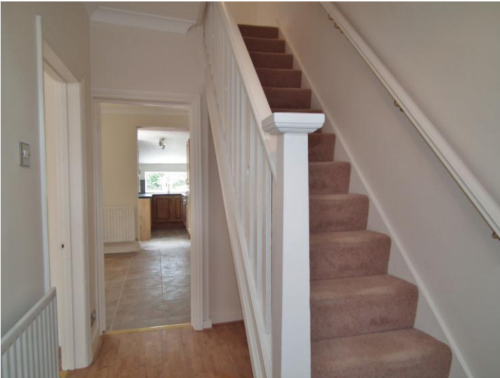
There is a bright hallway with doors into both front and rear receptions