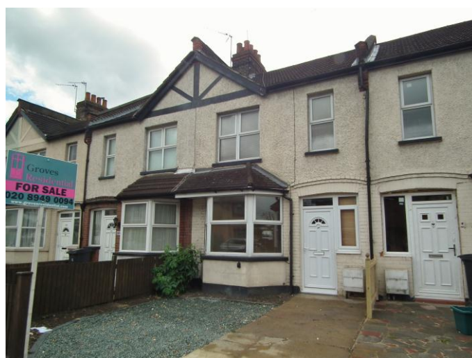
There is off-street parking in front of the property