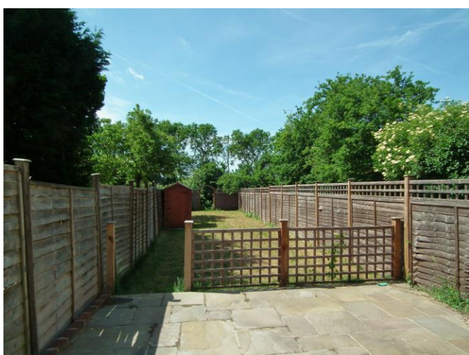
The rear garden is around 95ft long and has a patio plus a lawned area and a garden shed.