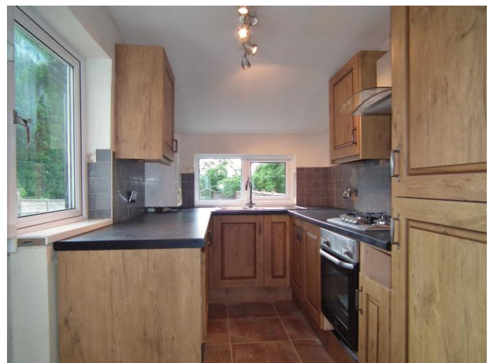
The front reception has wood floor and a bay window whilst the rear reception is open to the newly installed kitchen.