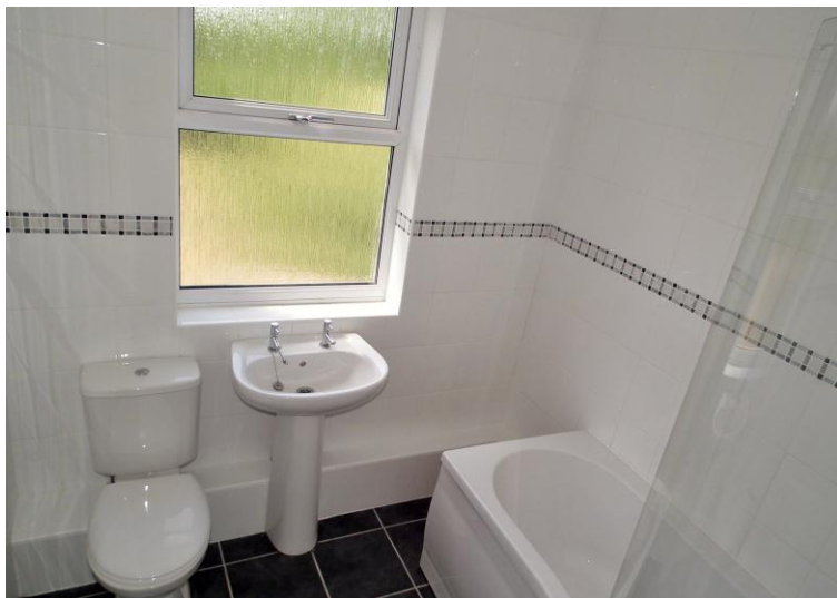
The modern bathroom is generously tiled and has a bath incorporating a wider shower area with screen.