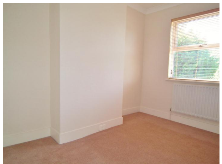
On the first floor there are two bedrooms and a modern bathroom